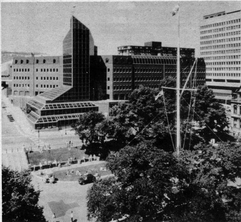
The World Trade and Convention Centre in Halifax... the conference site for CLA '88.