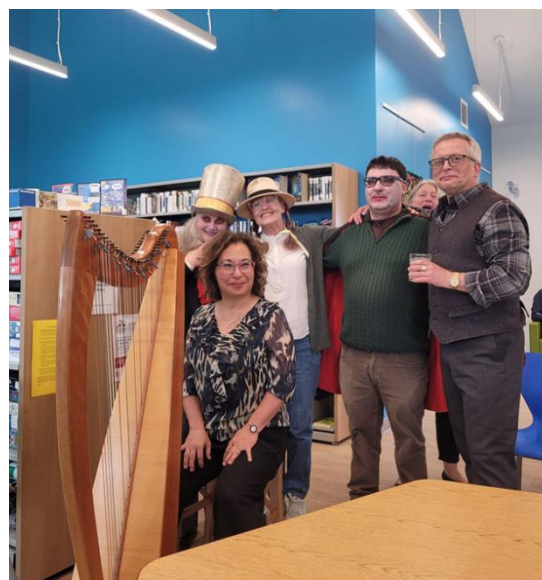
The Mad Hatter, Anne of Green Gables, Dracula, and Sherlock Holmes pose for a photo after “Art Attack”; hosted at the Pugwash Library by the Pugwash Artist Collective and local artists

The Pugwash Artist Collective was able to raise enough funds to purchase new installation systems, providing the library with more space to display local artwork for all to enjoy.