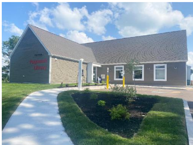
The new purpose-built Pugwash Library.

Our Pugwash Grand Opening Celebrations happened on Saturday, July 29th to coincide with the Village's Harbourfest celebrations. Throughout the day, community members joined us for the official ribbon cutting ceremony, tours of our new facility, activities for the kids, and more.