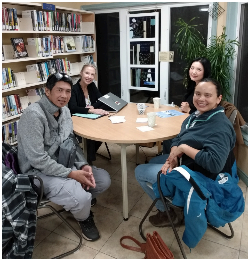
The Conversation Circle at the Kensington Heritage Library, November 2025.

newcomers/immigrants to practice their English in a group setting, but it's been an eye-opening and educational experience for staff to learn about different cultures and backgrounds.”