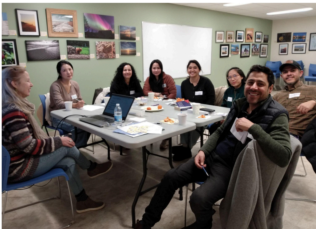
Members of the Conversation Circle at the Summerside Rotary Library, November 2025.