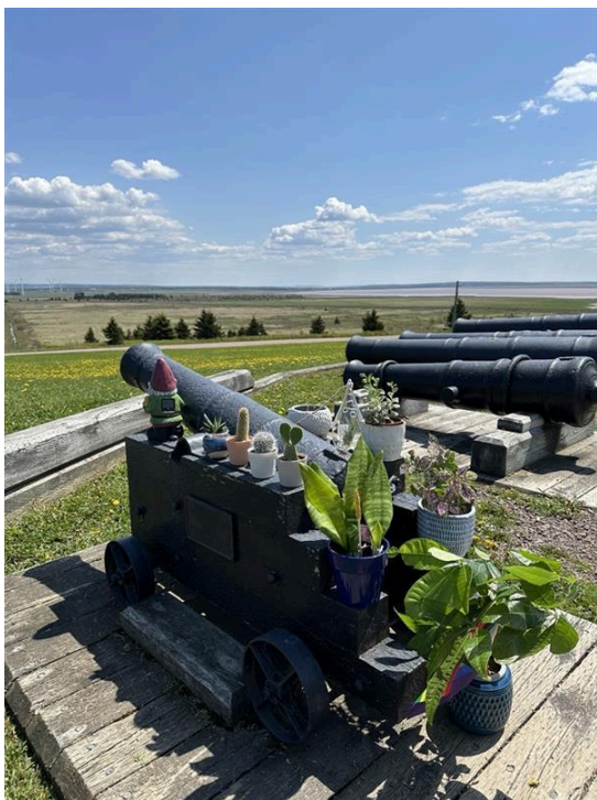
A field trip to Fort Beausejour

Follow Plant Camp on Instagram @mta_libraries