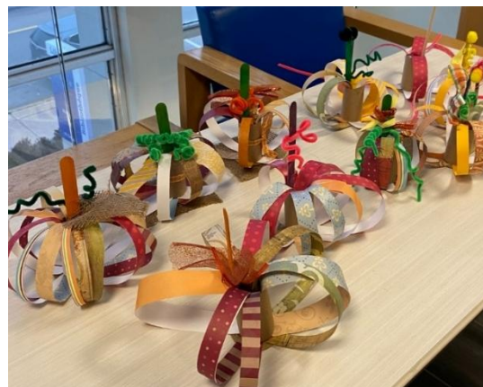
Paper Pumpkins from Summerside Rotary Library

Charlottetown Library Learning Centre staff took Halloween by storm and staff wore amazing costumes.