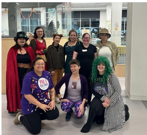
Staff Costumes from Charlottetown Learning Centre