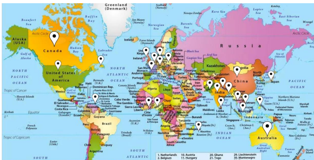
Postcards home from UPEI to across the globe