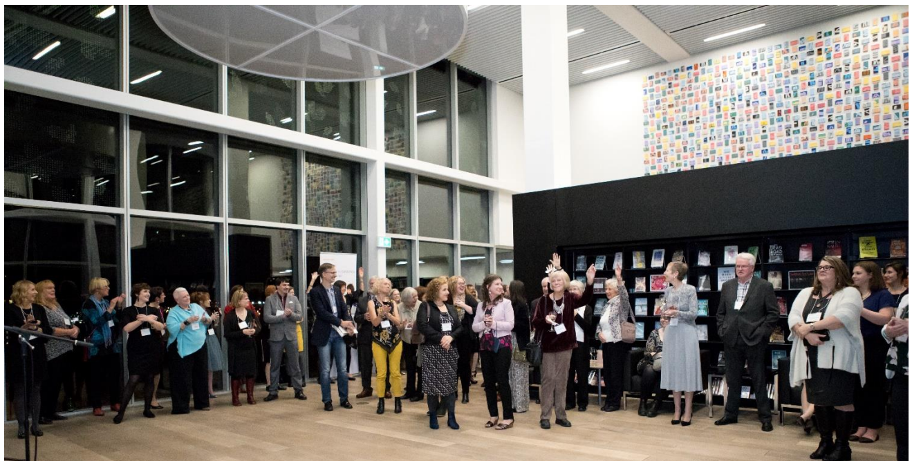
Alumni who were there at the beginning, in 1969, were asked to raise their hands. These included a few from SIM's first graduating class (1969-71). Below is the complete list of SIM's first graduates