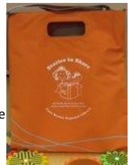
Stories to Share Bag

CBRL is in the preparation stages of a new initiative to provide young families with an easy way to choose books for their preschoolers. Modeled after the “Read, Talk, Sing” program of the Annapolis Valley Regional Library, the “Stories to Share” program will provide a list of 100 terrific books recommended by library staff to give children a head start before school. The books themselves can be borrowed five at a time in bright orange book bags, so the families can work their way through the checklist. They will be available through any library branch or bookmobile. We hope to have the bags ready soon!