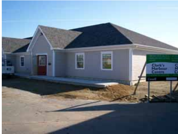
New Clark's Harbour Branch Library opening Dec. 11

of very young children. The Read to Me program encourages all new parents to read to their children from birth. The library works with the regional hospitals to ensure that all babies receive the Read to Me package, which contains baby books, a lullaby CD and an invitation to join the library.