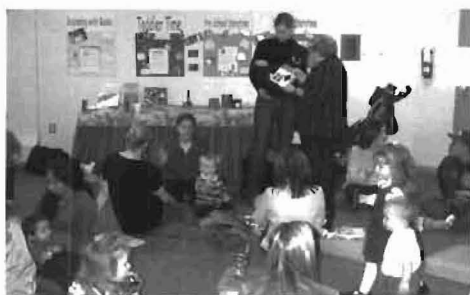
McConnell Library's "Read to Me" Jamboree

The Cape Breton Regional Library hosted "Read-to-Me" Jamborees at the McConnell Library (Sydney), the Wilfred Oram Library (North Sydney), and the Glace Bay Library (Glace Bay) to celebrate the Nova Scotia "Read-to-Me" Family Literacy Program. The McConnell library held their Jamboree on October 20. A large crowd of over fifty parents, caregivers and children enjoyed sharing stories, songs, rhymes and playtime.