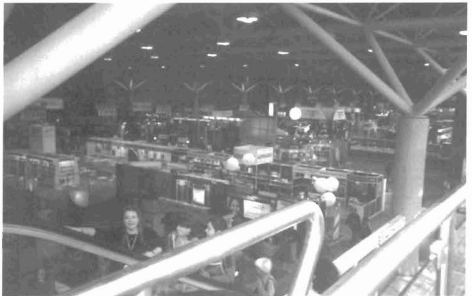
Some of the 800 or so conference exhibitors in the MTCC's North Hall

I attended a day-long business meeting with other parliamentary librarians from across Canada who are members of the Association of Parliamentary Librarians in Canada (APLIC). This meeting was held at Queen's Park, the seat of Ontario's Legislature. At this meeting, representatives from the majority of the country's legislative libraries