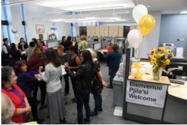
The crowd enjoying some live classical guitar music and refreshments.