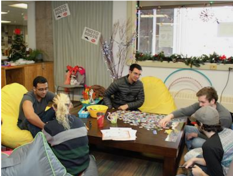
Students enjoying the Stress Free Zone

Robertson Library launched their stress-free zone during the exam period with a pajama party. The party included snacks, a photo booth, maker-type activities, yoga and stretching, palm reading, tarot reading, therapeutic touch, and dancing. The stress free zone was a popular place for students to relax during exams.