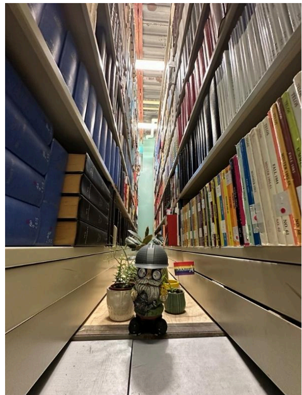
A visit to off-site serials storage in the basement of Convocation Hall