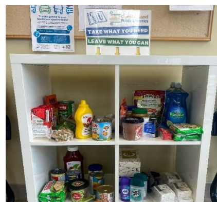
The food pantry located at our Amherst location. The food pantry is a partnership between the library and our community partner CANU.

Within the library, we are supporting patrons by providing snacks at our seven locations. We have also installed a food pantry in our Amherst location.