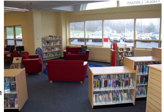
Scenes from Captain William Spry before, during and after the renovations

The library closed in March and reopened in May. While there were no additions built onto the library, the space for the public is now larger. This increase in space was made possible by reorganizing staff work areas. On opening day, patrons were greeted with new materials on the shelves, new toys and learning objects for toddlers, more computers and comfortable seating as part of the remodeled branch.