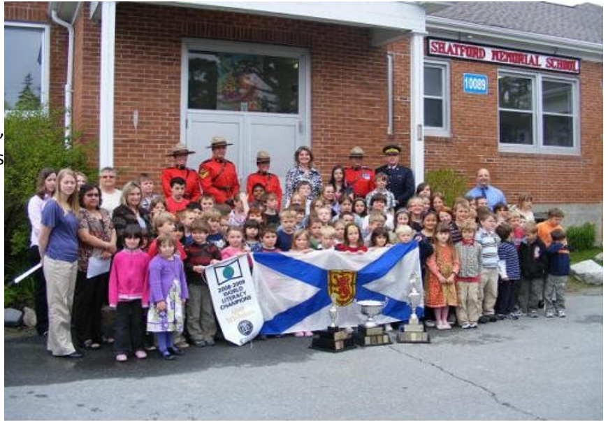
The proud students at Shatford Memorial Elementary with their championship banner.

Shatford Memorial Elementary earned over $10,000 worth of books for winning the WOW Reading Challenge. The individual student who read the most books in the challenge got to be principal for a day. And the school is still enthusiastic about reading — they've planned to walk to J.D. Shatford to learn about the summer reading program before school lets out in June.