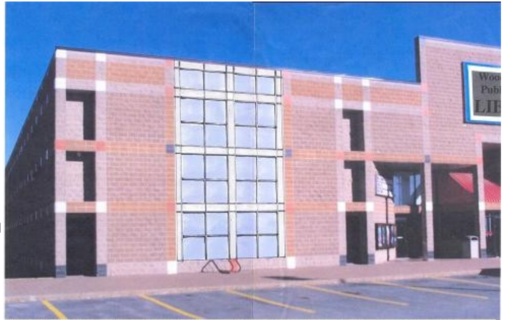
The current Empire Theatre building and a drawing of what the outside of the new Woodlawn Library will look like.