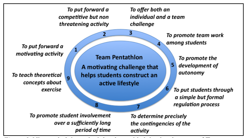
Figure 1. Nine underlying principles that guided the development of Team Pentathlon.

From the start, nine underlying principles guided the development of the intervention (see Figure 1). The first four focus more on student motivation while the five others are linked more closely to the development of the targeted competency. First and foremost, the notion of motivating challenge and student motivation were perceived as paramount. To keep these in mind, the developers of the intervention programme were inspired by five criteria in the elaboration of a motivating task (Florence, Brunelle, & Carlier, 1998). These criteria were task dynamism (meeting student need for movement and engagement), task originality (meeting student need for discovery), task emotional load (meeting student need to surpass one self, to dare), task openness (meeting student need for self-confidence and acceptance) and task meeting (meeting student need for understanding). According to Florence et al. (1998), when these criteria are applied, the end result is a motivating task positively perceived and readily accepted by students from the start. Elements related to the development of a competency were drawn mainly from the introductory material of the Quebec education programme (MEQ, 2001, 2004).