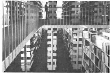
Library, Pavillon Lalemant, College Jean de Brébeuf, Montreal. This photograph shows how a Montel Mezzanine doubles useful shelving space in a high ceiling library — approx. 14 ft.

Does the face of your librarian reflect an underlying chaos in the library? Does lack of space, inadequate shelving, improper layout contribute to the slowing down of the smooth-running of the library — despite the efficiency of the library staff?