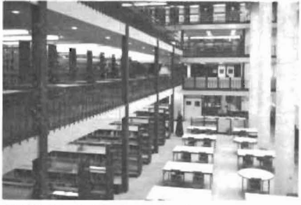
C.E.G.E.P. Chicoutimi. The Montel Closavista system combines functional good looks with ease of assembly.