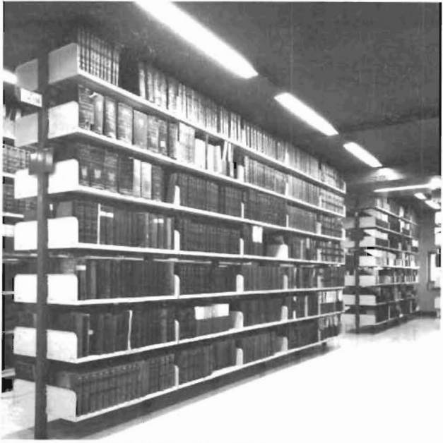
A secondary alley in the National Library, Ottawa. All steel bookcases installed in this library are Montel Ancravista.